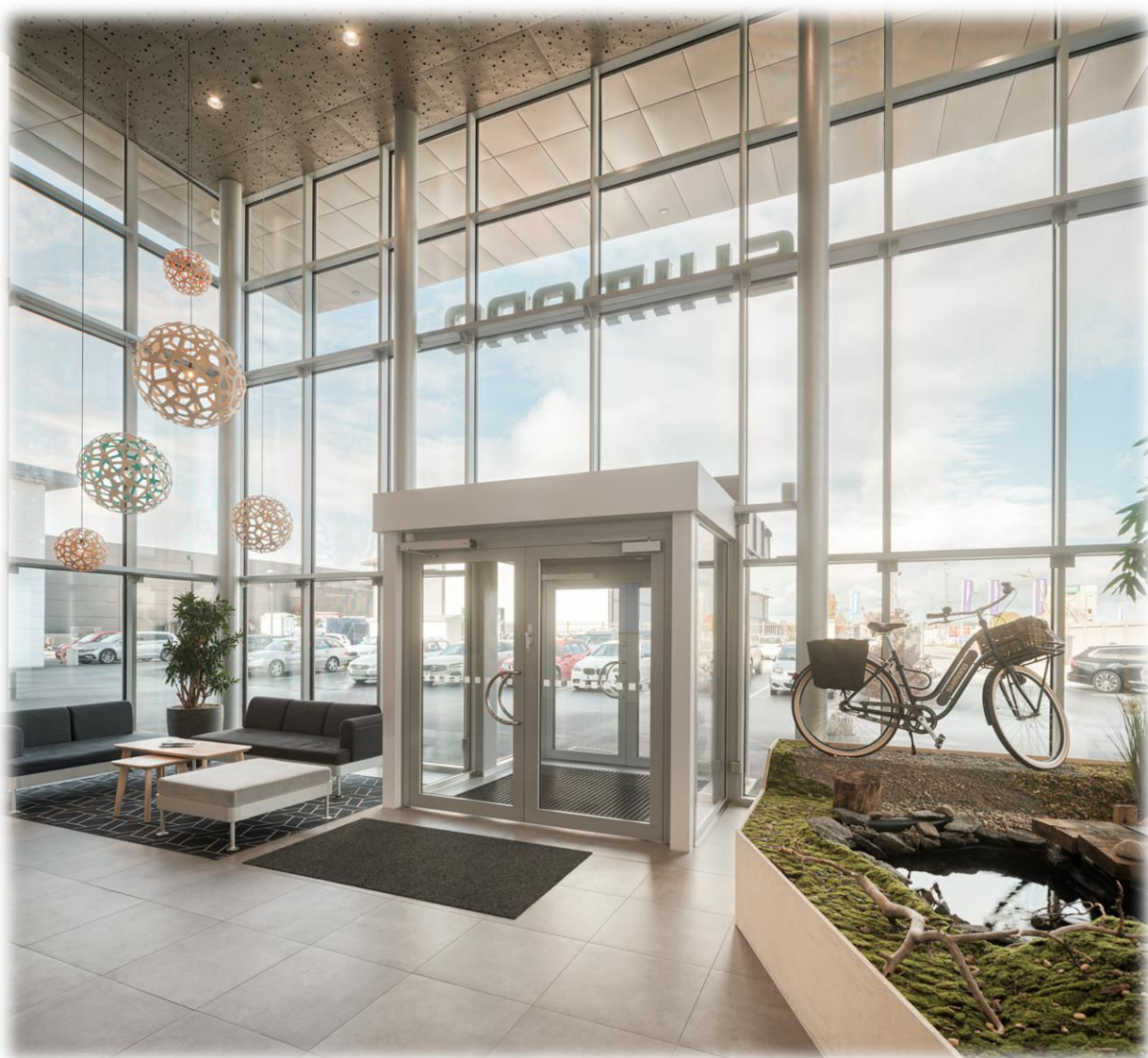
Picture of interior from Shimano Uppsala